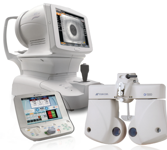
Topcon's KR-1W Wavefront Analyzer (behind) and CV-5000S Automated Vision Tester (front).