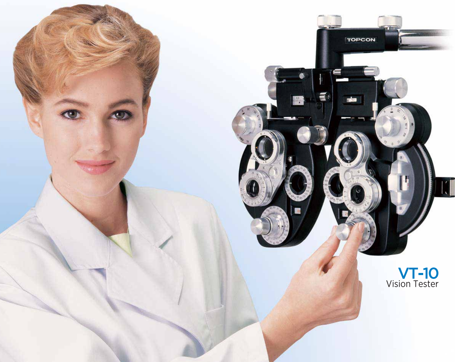
VT-10 Vision Tester

Precision and convenience are a tradition in high quality TOPCON optical instruments. The VT-10 vision tester advances this tradition still further, making refraction quicker and easier than ever before, providing unequalled performance and exceptional versatility. Precision in design and workmanship guarantees accuracy in refraction measurements-accuracy that won't deteriorate even after long years of use. Total quality from TOPCON means you can have total confidence in the performance you'll enjoy from the VT-10 vision tester.